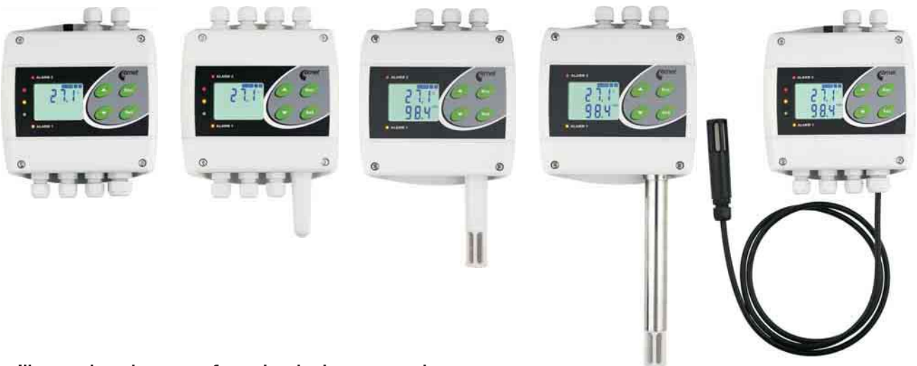
Illustrative pictures of mechanical construction of Hxxxx transmitters